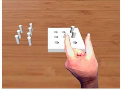
Figure 1. Reaching for a virtual peg (left), moving it towards its destination (centre) and releasing it (right)