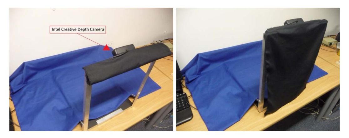
Figure 2. Metal Frame used to position the depth cam without curtain (left) and with the curtain to prevent the direct view of the hand during use (right)

The hardware "therapy frame" (Figure 2 left) where the webcam is mounted, consists of a flat board with a metallic frame attached to the front of it. On the top of the frame, the webcam (described above) is attached and points toward the board at a 45 degree angle. A black curtain in front of the frame prevents the user from seeing the real interaction (Fig. 2 right). This is to direct the participants' attention to the interaction shown on the screen and to maintain the illusion of interacting in the virtual space during the tasks. A blue fabric is used to cover the base.