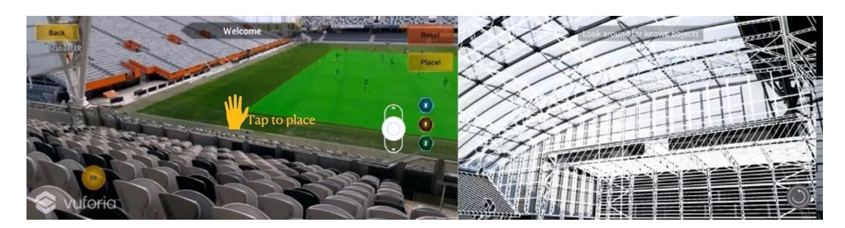
Figure 2: Localization methods for AR interface. Left) User-guided localization requiring the user to input seat location and provide alignment to a digital pitch map. Right) Automatic model-based localization using a 3D model of the stadium.